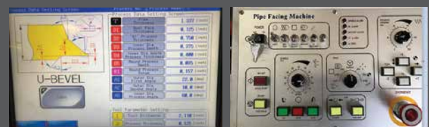
Standard, Simple Programming